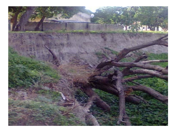
Figure 7. Gully effect on vegetation along River Bosso