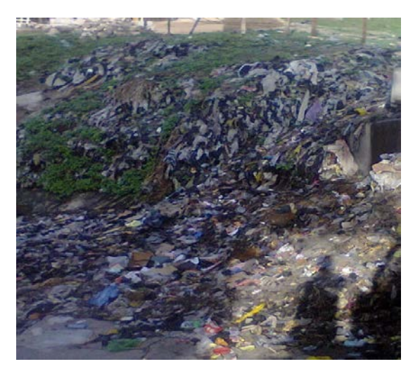
Figure 3. Refuse dump along River Bosso

• Farm practice was also recorded as a contributory factor as some ridges were cultivated perpendicular the slope (Figure 5). This encourages runoff and erosion.