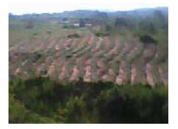
Figure 5. Farm ridges placed perpendicular to River Bosso Channel

• Building on the flood plain (Figure 6) of river Bosso was also observed as a contributory factor to gully erosion growth in the area as any construction on flood is inimical to the river system.