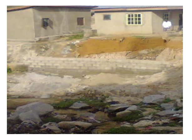
Figure 6. Building on flood Plain along River Bosso

• The gully poses danger not only to human being and their properties but also to vegetation (Figure 7) as more trees are being consumed as a result of the expansion of the river channel.