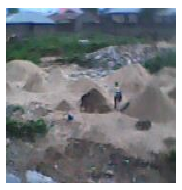
Figure 4. Sand excavation along River Bosso